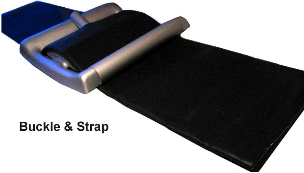
Buckle & Strap

There are three components that make up the luggage tag prop for a single billboard: 1) Buckle & strap, 2) Support Frame (with additional support arm, tied to the support frame for shipping), and 3) Palette containing the hardware, arm extensions, and corner extensions. One set of these three items needs to stay on the truck for delivery to Interboro Signs in Long Island City.