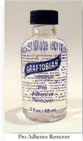
Pro Adhesive Remover

Whether you use Pro Adhesive Remover or ISM, we recommend that you first remove the appliance using 99% rubbing alcohol so the edges do not bloat, then use Pro Adhesive Remover or ISM to remove any remaining adhesive on the skin. Be careful not to get any Pro Adhesive Remover or ISM into the eyes of the wearer since both products contain rubbing alcohol.