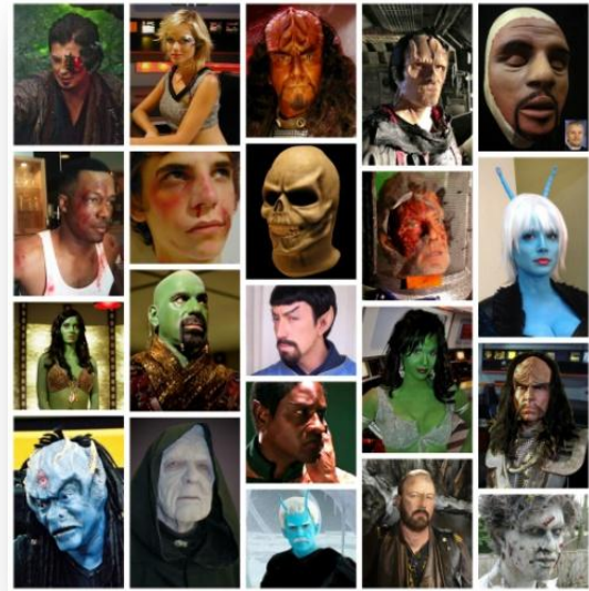
Special Effects Make-up

Masks or prosthetic appliances made of foam latex, on the other hand, can be totally convincing and undetectable, even at close range. They allow the wearer's facial expressions to show through the make-up. A full range of emotions can be seen through foam latex, since the material acts very similar to real skin. And the wearer can eat, drink and wear the make-up for long periods, an absolute necessity in film making. Once you've experienced the quality of foam latex masks, you won't settle for anything less.