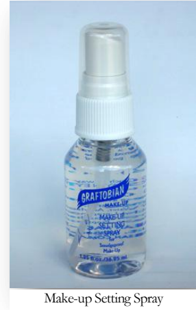
Make-up Setting Spray

Powder can be applied using a powder brush or a puff. If you use a powder puff, load the powder into it by putting a generous amount of powder onto the puff, folding it in half and rubbing the two halves together. If you use a powder brush, roll the brush into the powder to load it. Press (don't wipe) the powder puff or brush onto the make-up to set it. Once set, the make-up will not smear.